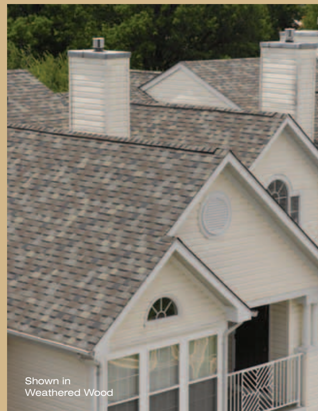
Shown in Weathered Wood

Patriot combines the ultimate in value and durability with unmatched curb appeal.