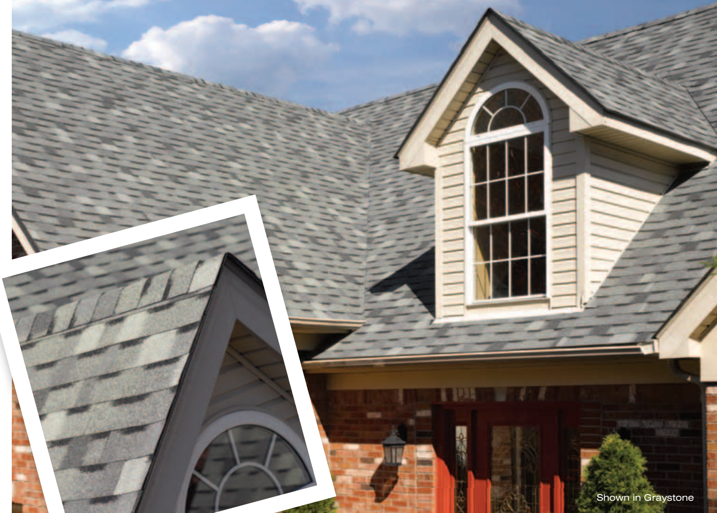
Shown in Graystone

Your home is a reflection of your lifestyle.