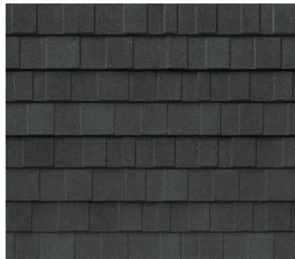
DECRA SHINGLE XD Midnight Eclipse