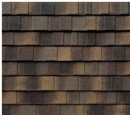
DECRA SHINGLE XD Old Hickory