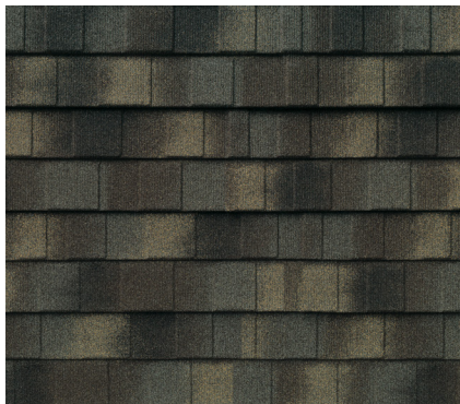
DECRA SHINGLE XD Classic Cobblestone