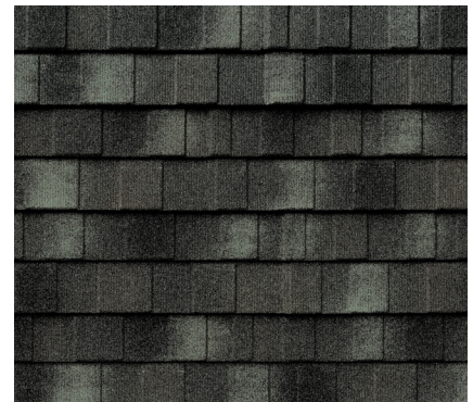
DECRA SHINGLE XD Natural Slate