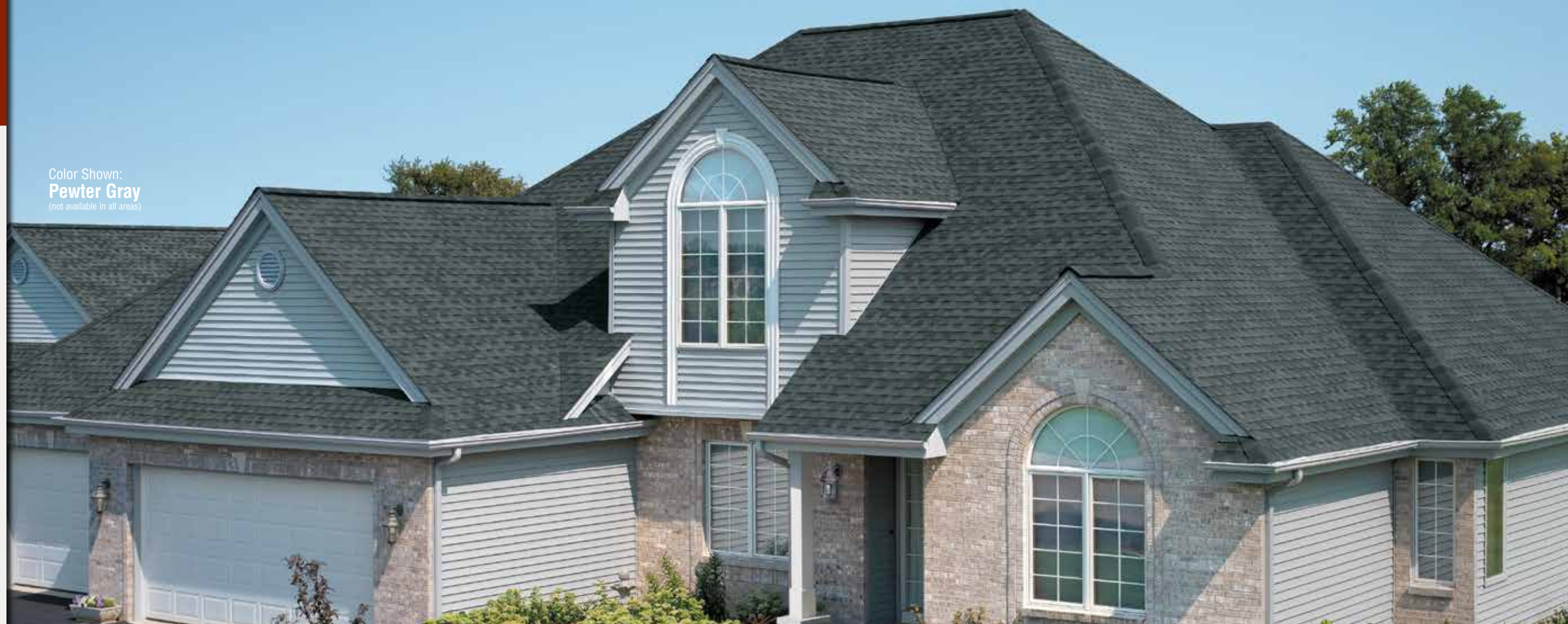
Color Shown: Pewter Gray (not available in all areas)

Note: It is difficult to reproduce the color clarity and actual color blends of these products. Before selecting your color, please ask to see several full-size shingles.