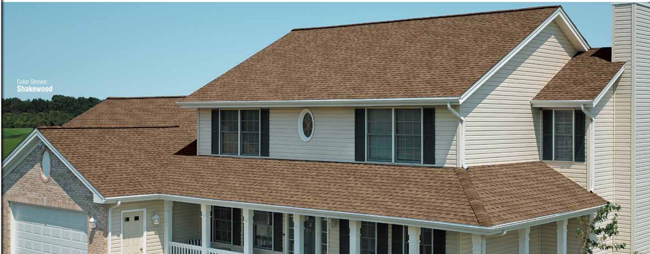
Color Shown: Shakewood