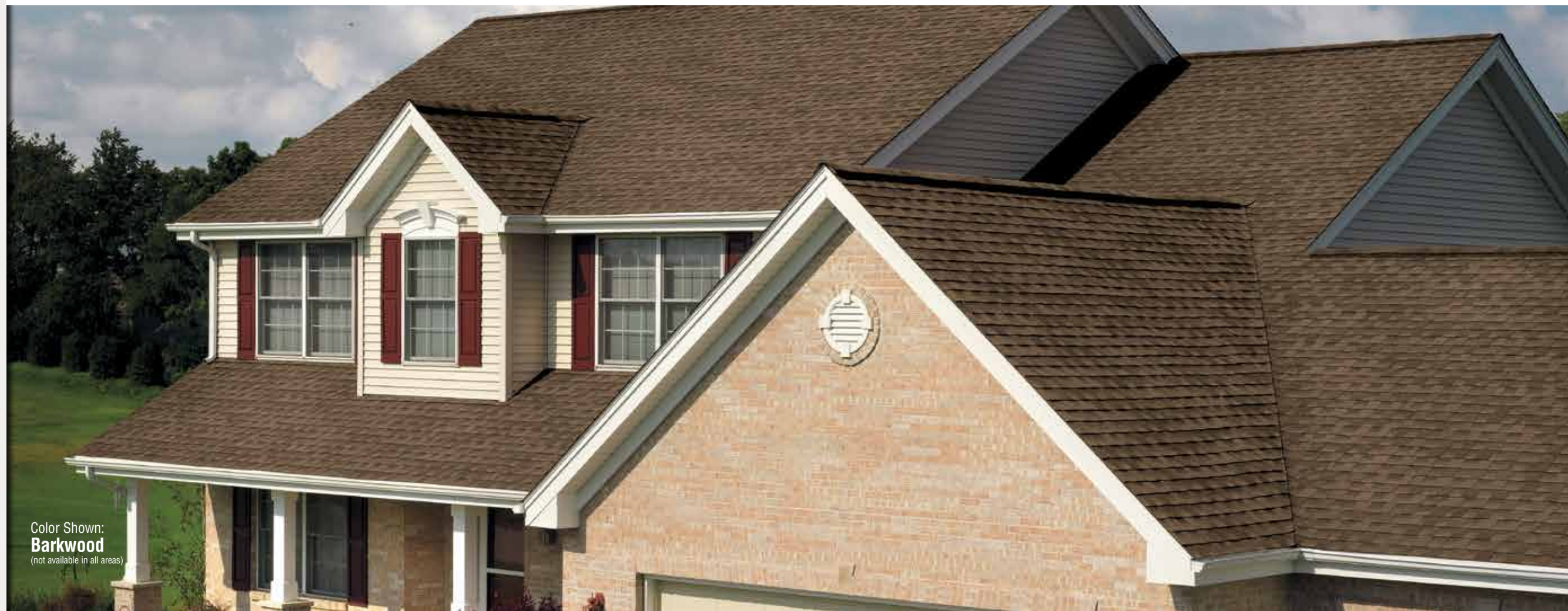
Color Shown: Barkwood (not available in all areas)