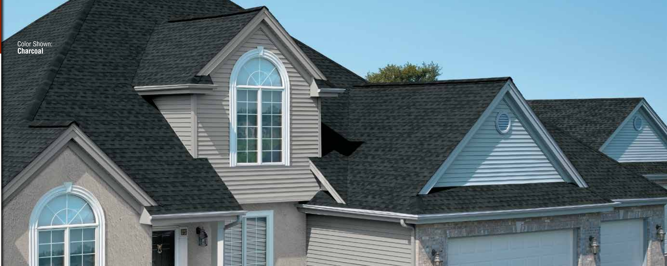
Color Shown: Charcoal

Note: It is difficult to reproduce the color clarity and actual color blends of these products. Before selecting your color, please ask to see several full-size shingles.