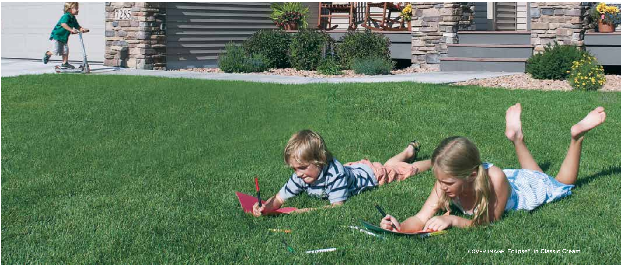
COVER IMAGE: Eclipse™ in Classic Cream