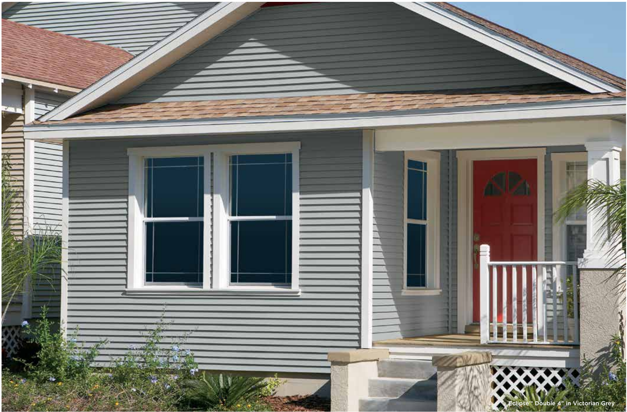
Eclipse™ Double 4" in Victorian Grey

No paint. No stain. No hassles. Eclipse™ delivers the classic look of real wood — minus the hassles and costly upkeep. This .040 panel with an advanced locking system and nail hem is rated to withstand windspeeds up to 165 mph. Eclipse™ delivers beauty and value.